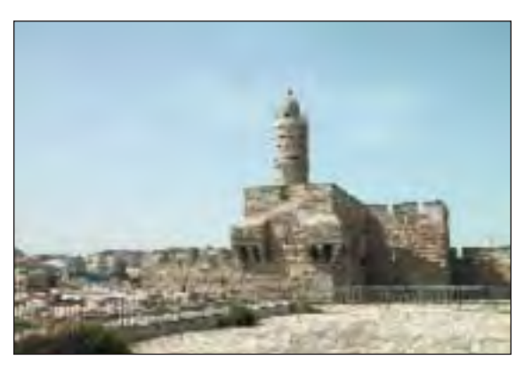
Citadel and Jaffa Gate

executed after he suspected that she was involved in some treachery against him). Some of the original stones used to build the tower named after Phasael can still be seen in the Citadel today. (The walls of the present Citadel were built by Suleiman the Magnificent in 1540 A.D.) Today, there is a magnificent museum inside the Citadel that depicts Jerusalem through the ages. To the left (north) of the Citadel is Jaffa Gate , where the road from Jerusalem to the port