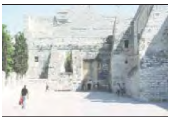
Bethlehem: Church of the Nativity

father's flocks from the lion and the bear (1 Sam. 17:34-35). But it is the image of "shepherds out in the field, keeping watch over their flock" that at Christmas time works its magic, and of an angel standing above the shepherds saying: "For to you is born this day in the city of David a Savior, who is Christ the Lord" (Luke 2:8-12). The site of the manger is said to be in a cave below the Church of the Nativity, which dates to the 6th century A.D. The original