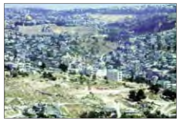
Jerusalem: City of David

(center) below the Temple Mount, opposite the village of Silwan (middle right). The end of Hezekiah's tunnel (2 Chron. 32:2-4, 30) and the Pool of Siloam (John 9:7-11) are located at the southern end of the City of David, where the Tyropoeon and Kidron Valleys meet to form a "V" (bottom right). The present day wall of Jerusalem's Old City was built in 1542 A.D., during the reign of Sultan Suleiman. Inside the