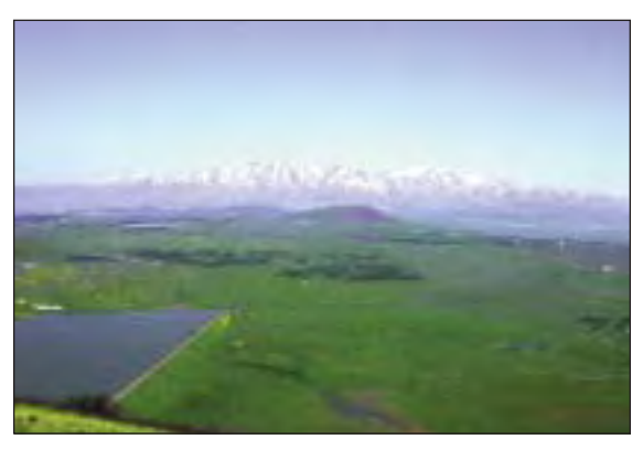
Mount Hermon and Upper Jordan Valley

Its majestic, often snow-capped peaks can be seen from many parts of Palestine. During the hot summer months the farmers of Palestine must look longingly toward Mount Hermon. The mountain looks down upon the Old Testament region of Bashan to the south and east, the Upper Jordan Valley to the south, and the "valley of Lebanon" (the Beq'a of modern Lebanon) to the west (Josh. 11:17). The water that falls on Mount