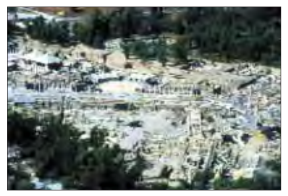
Beit-Shean (Tell el-Husn)

immense strategic importance. The site of Beit-Shean lies in the middle of the valley, approximately 400 feet below sea level. It guarded the eastern entrance to the Jezreel Valley and the main highway that crossed the Jordan at the fords south of the Sea of Galilee. Six Egyptian temples have been discovered at Beit-Shean. ranging from the 14th to the 11th centuries B.C. Beit-Shean is also mentioned in Egyptian