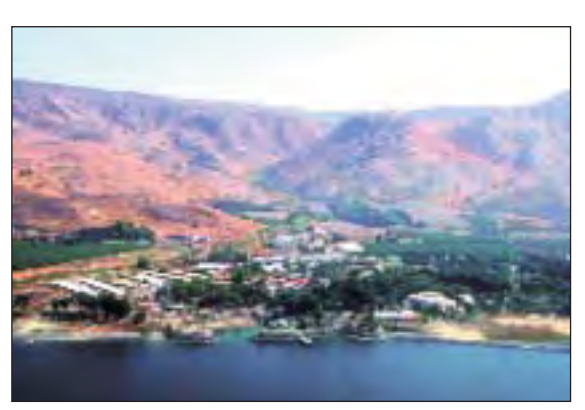
Hippus, Kursi: Country of the Gergesenes

in this picture marked the start of the Golan Region. The village of Kursi was at the point where the road leading up to Golan meets the shore road. According to an early Christian tradition, this was the place where Jesus caused certain demons to enter the bodies of pigs grazing on a nearby hill (see Matt. 8:28-34: Luke 8:26-39). A short distance south of Kursi is the only spot along the eastern shore where the mountains reach to the lake. A