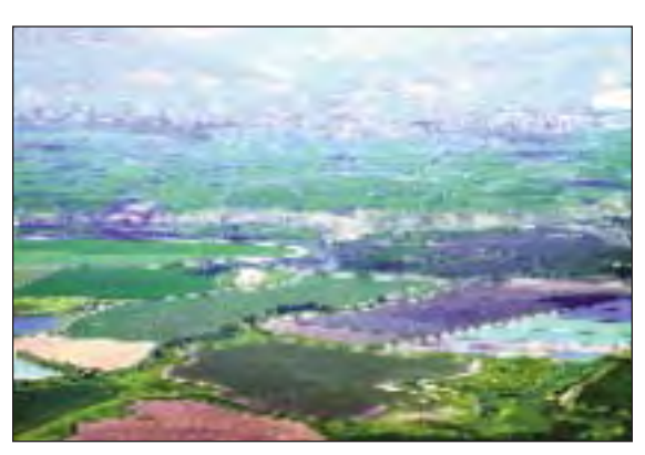
Lower Jordan Valley

River that flows through the "jungle" or "Swelling of the Jordan" called the Zor in Arabic, and the desolate area of eroded ridges and peaks that separates the Ghor from the Zor. The high mountain in the background is the Dome of Gilead, which is divided into halves by the Jabbok River ("half of Gilead" and the "river Jabbok" are mentioned in Josh. 12:2; the river valley of the Jabbok is just outside the upper left hand corner of this picture).