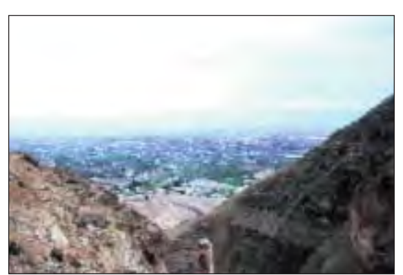
Mount of Temptation and Jericho

was taken from the Mount of Temptation . the traditional "high mountain" from which Satan showed Jesus "all the kingdoms of the world and the glory of them" (Matt. 4:8). These mountain cliffs mark the beginning of the Judean Wilderness, the eastern frontier of Judah. The oasis of Jericho is the green area in the center of the picture. The men of ancient Jericho searched for Joshua's spies along the road that led from Jericho to "the fords" of the Jordan River (Josh. 2:1-7).